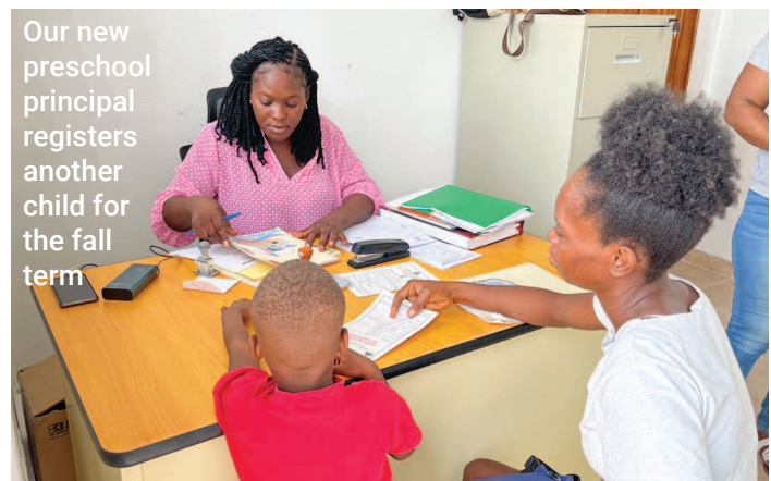
Our new preschool principal registers another child for the fall term