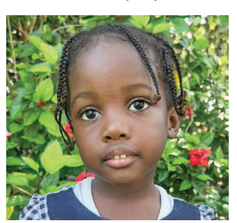
Gwessy Birthdate: 1/27/2022