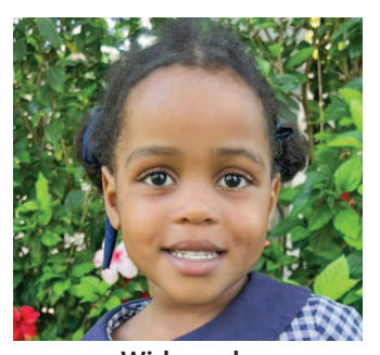
Widenaela Birthdate: 11/18/2021