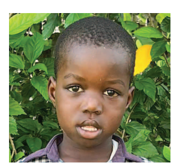
Walens Birthdate: 1/22/2020