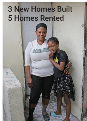
3 New Homes Built 5 Homes Rented