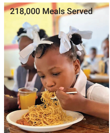
218,000 Meals Served