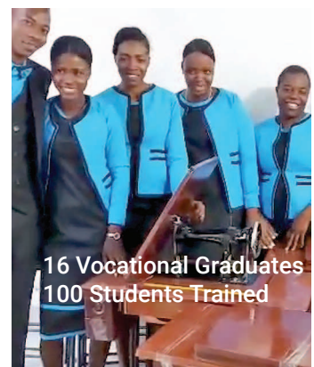
16 Vocational Graduates 100 Students Trained