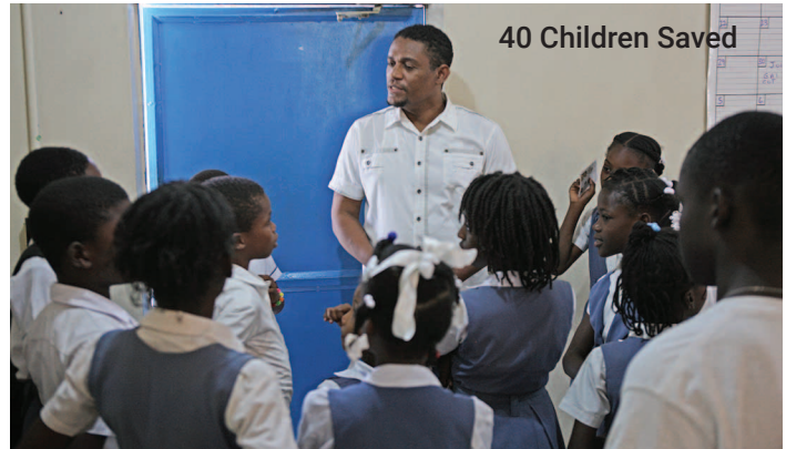
40 Children Saved

Last year finished strong. This year there is more that needs to be done. Haiti needs your support! Together, we can equip more children and young people to change Haiti for Christ. Thank you.