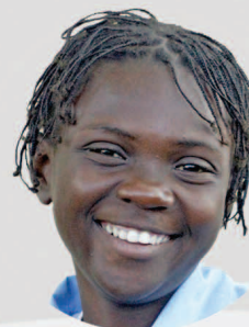
Equipping Haitians to Change Haiti for Christ