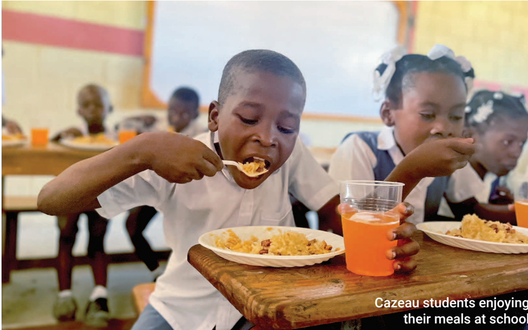
Cazeau students enjoying their meals at school

The expanded school meals continue to have a significant impact, not only on the children in the schools, but on the surrounding community as well. A good example of this is at the Cazeau school.