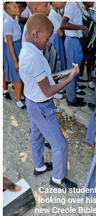
Cazeau student looking over his new Creole Bible

The schools need $2,000 a month to continue expanding this vital ministry. Thank you for giving!