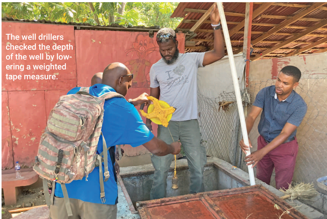
The well drillers checked the depth of the well by lowering a weighted tape measure.

When we were preparing to dig the new well at Guedon recently, we asked the well drillers to evaluate the well at the Cazeau school. The principal told us the electric pump stopped working. The well drillers made several trips to check it. They discovered that the well is 50 feet deep and the water is slow to refill. That is what caused the electric pump to overheat and become ruined.