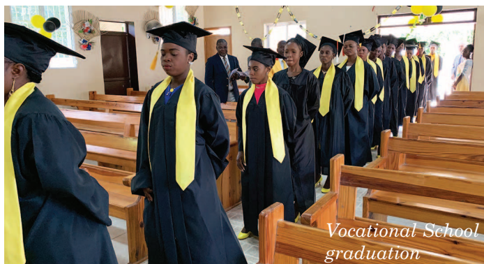
Vocational School graduation

Thank you so much for your monthly offerings and special gifts. We balanced our accounts in 2019. We want to do more in 2020. We need your help! Together, we can equip more Haitian young people to learn more, to be healthier, to live better and to change Haiti for the glory of God.