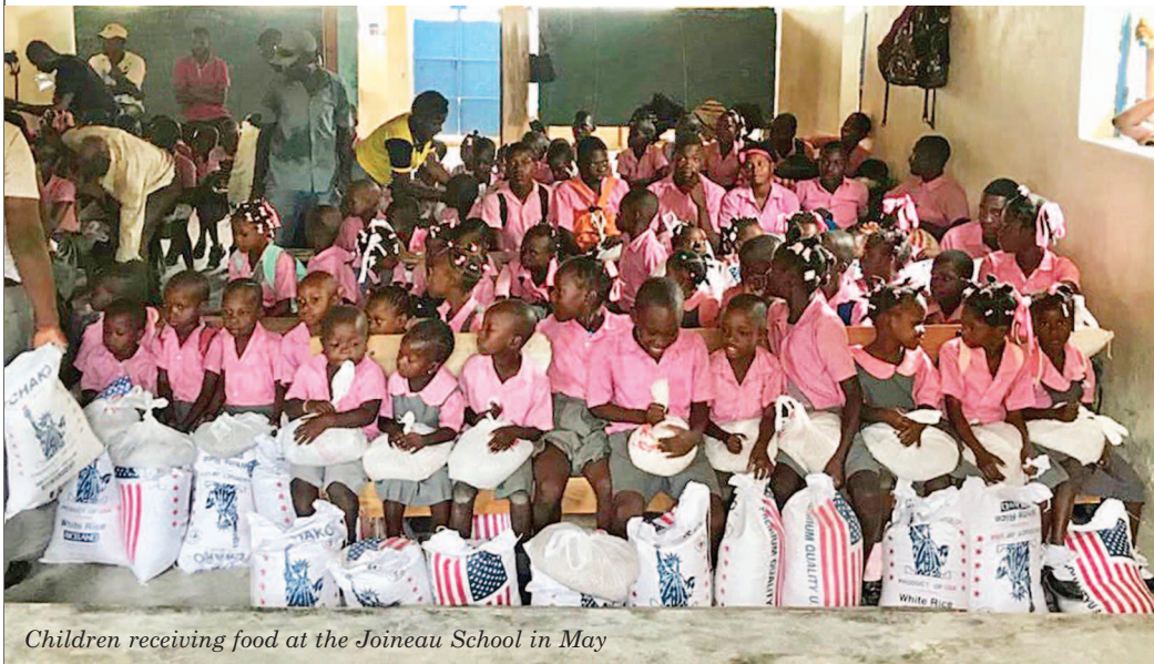
Children receiving food at the Joineau School in May

We want to give beans and rice to all of the children and teachers in our sponsored schools. We are giving these through special food distributions.