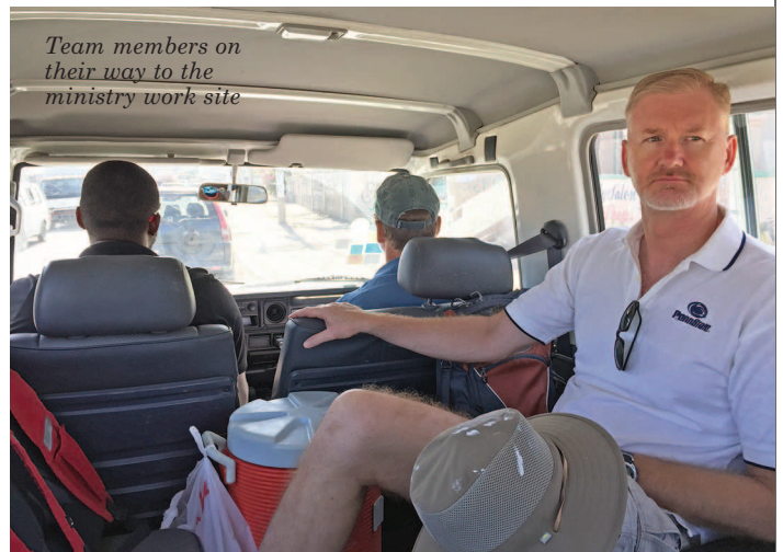
Team members on their way to the ministry work site

Thankfully, the two Toyota Land Cruisers we have serve us well. We take them everywhere we go. They require regular maintenance and repair from local mechanics to keep them going month after month. When the Toyotas are not enough, we use our bus or we rent large vehicles to haul things like building materials and food. Reliable transportation is a major part of spreading the Gospel and getting to children who need our help. It will cost $50,000 to cover our Operating Expenses in Haiti for 2019. When you give to Our Founders' Challenge, you help us reach our destination.