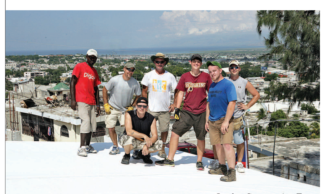
October Construction Team

cases. A number of children have had surgery and been treated for severe issues this year.