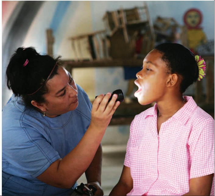
Our next Mission Team will be October 12 - 19

Sponsorship Payments Month $35 Quarter $105 Year $420